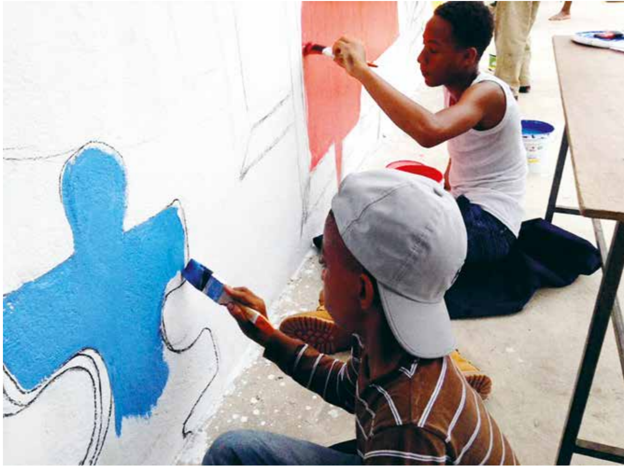
REALISATION OF A MURAL Kingston, 2016

Being surrounded by other artists encourages us and gives us the strength to follow our path. We can learn in a serene way because we are doing what we like doing. This project has given me a lot, especially teaching me that each one of us has his or her way of learning. It's by recognizing these differences and identifying the necessary information to reach our goals that we give ourselves the tools to grow individually.