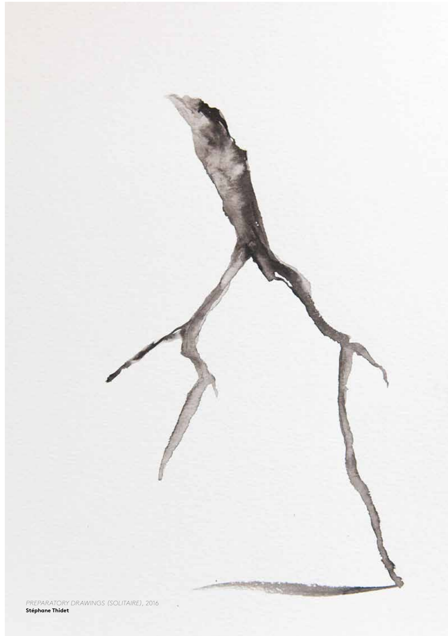
PREPARATORY DRAWINGS (SOLITAIRE), 2016 Stéphane Thidet