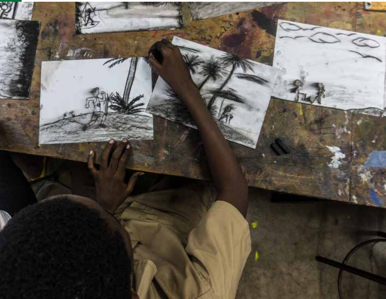
DRAWING WORKSHOP Kingston, 2017