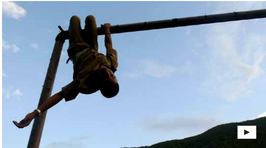
Video still, Hallelujah Wave , 2017

2017 HALLELUJAH WAVE A film by the InPulse students and Nile Saulter