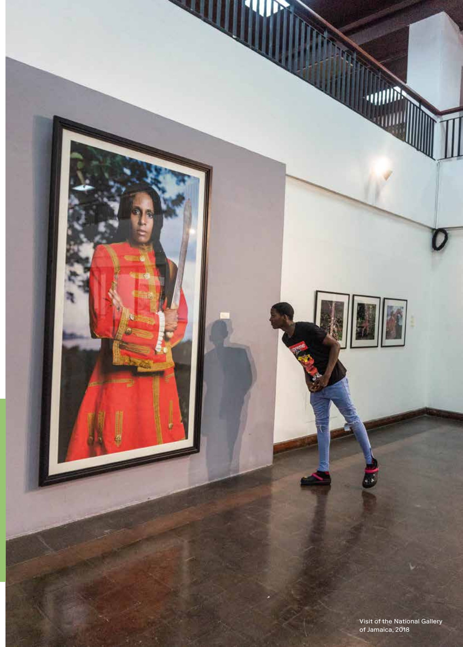
Visit of the National Gallery of Jamaica, 2018