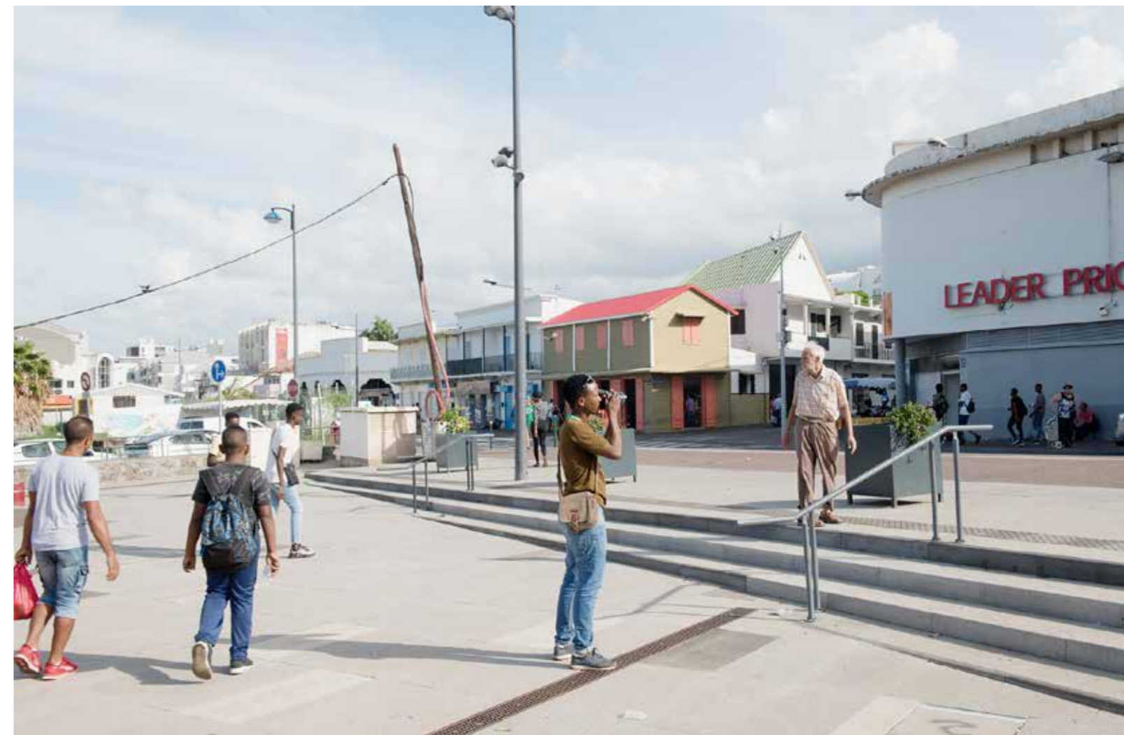
“The Long Way” residency, Reunion, 2019

6 additional scholarships awarded to Of Soul and Joy photographers to study at the Market Photo Workshop in Johannesburg