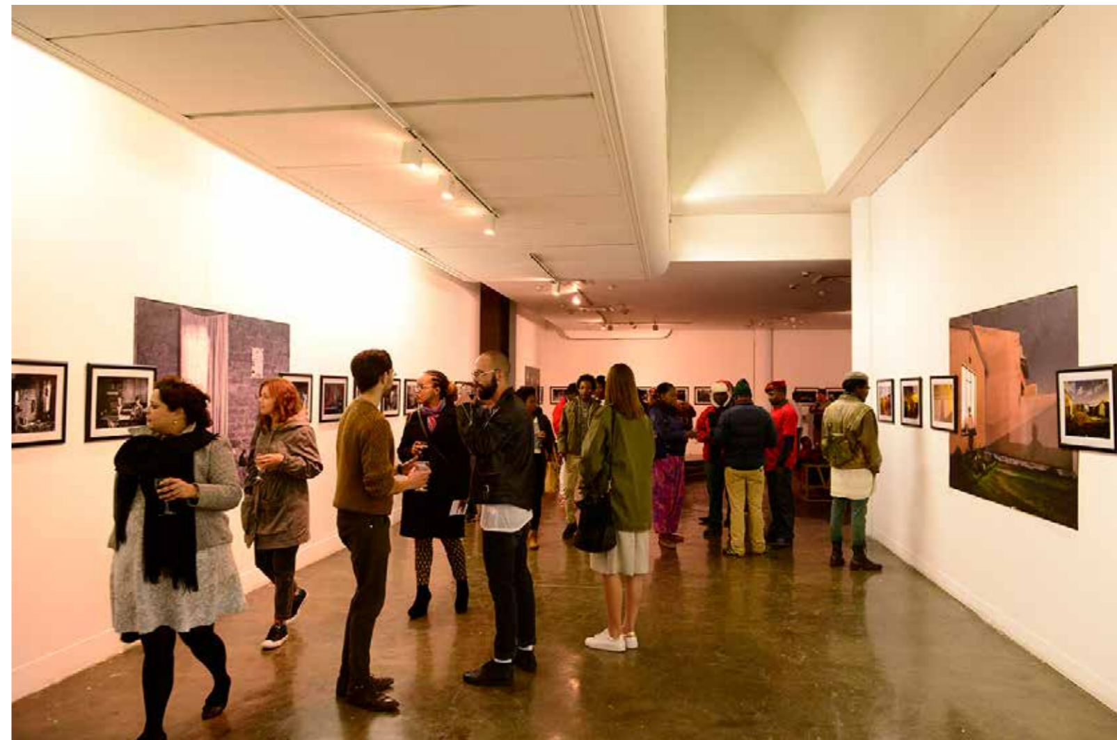
Free from my Happiness exhibition, Johannesburg Art Gallery, 2016