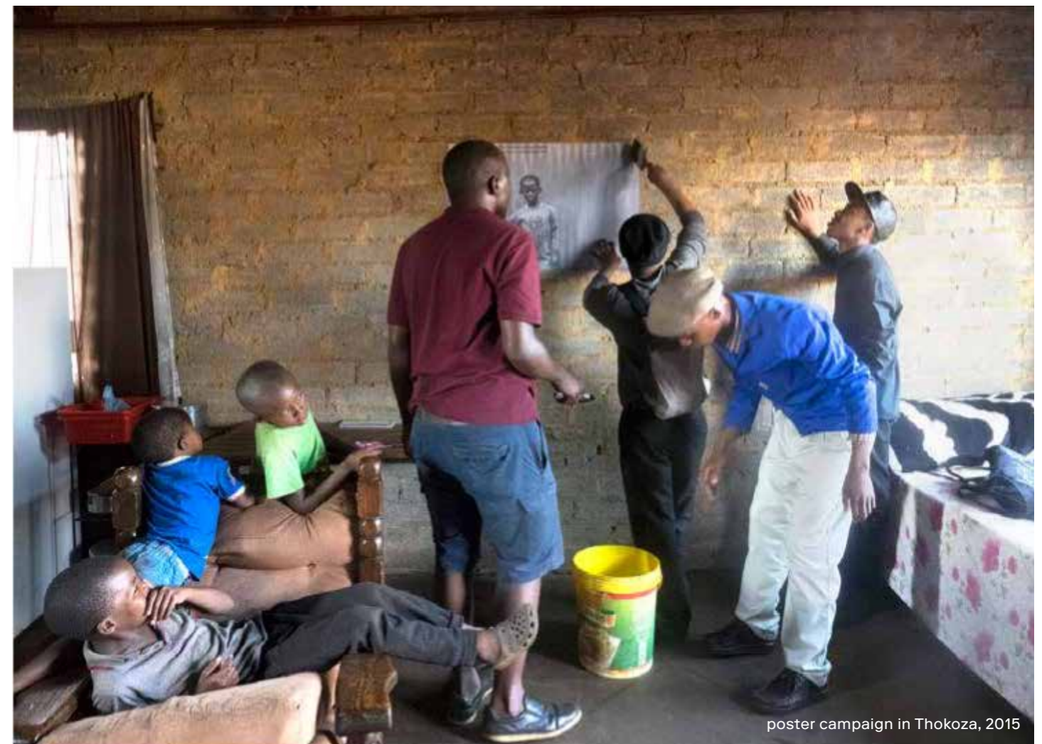
poster campaign in Thokoza, 2015