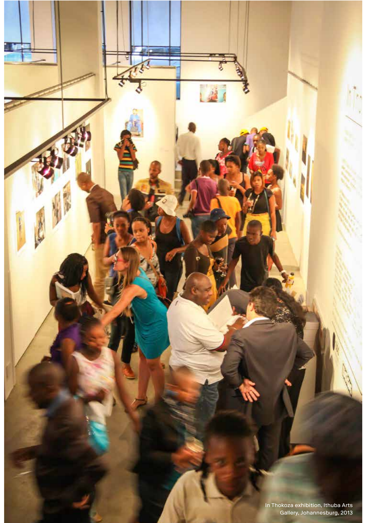
In Thokoza exhibition, Ithuba Arts Gallery, Johannesburg, 2013