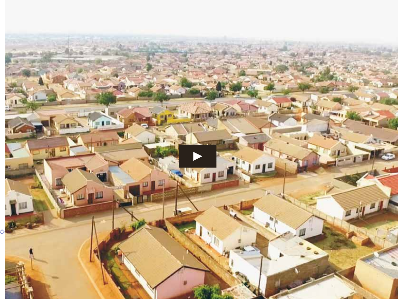
In Thokoza, documentary film on the Of Soul and Joy project, 2013-2016