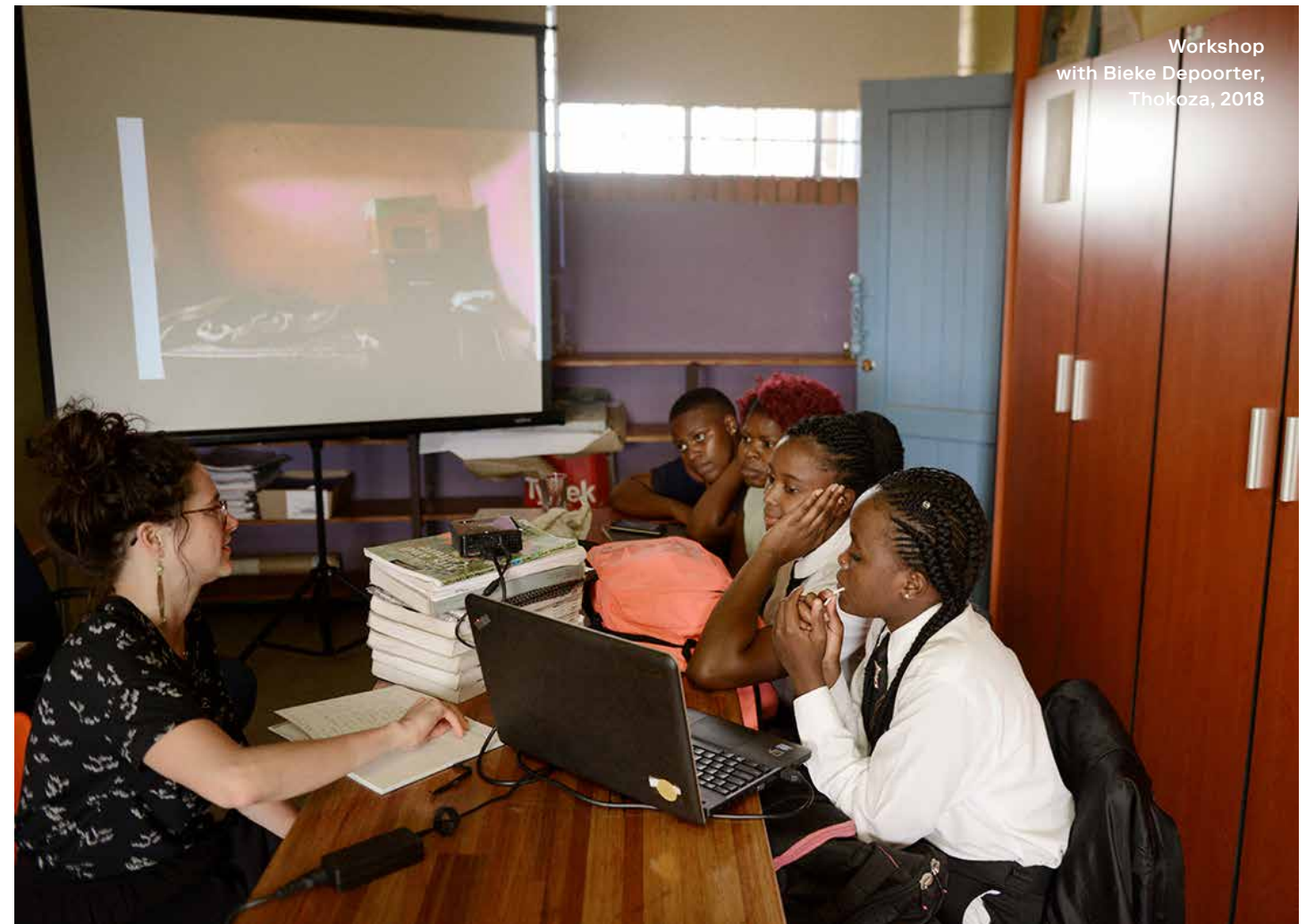
Workshop with Bieke Depoorter, Thokoza, 2018

The programme benefits approximately 20 participants yearly aged 15-30 years old. The participants are either high school students from the Buhlebuzile Secondary School or young adults willing to stimulate their creativity and deepen their artistic knowledge in the field of photography.