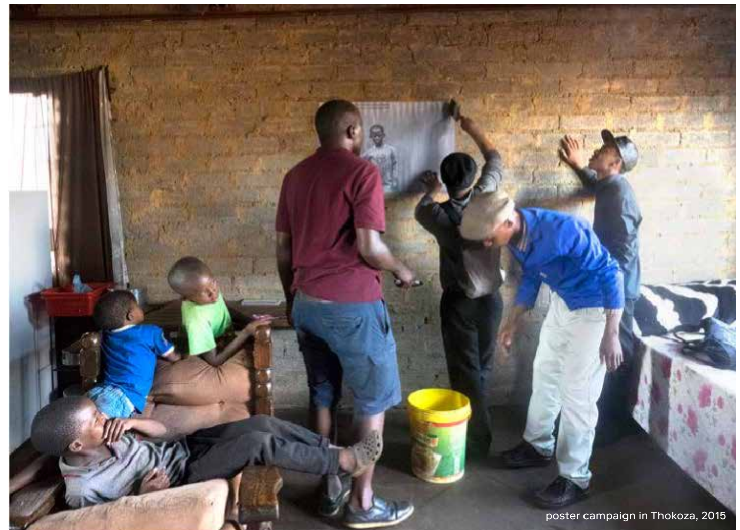
poster campaign in Thokoza, 2015