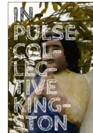
InPulse Collective - Kingston, 2018