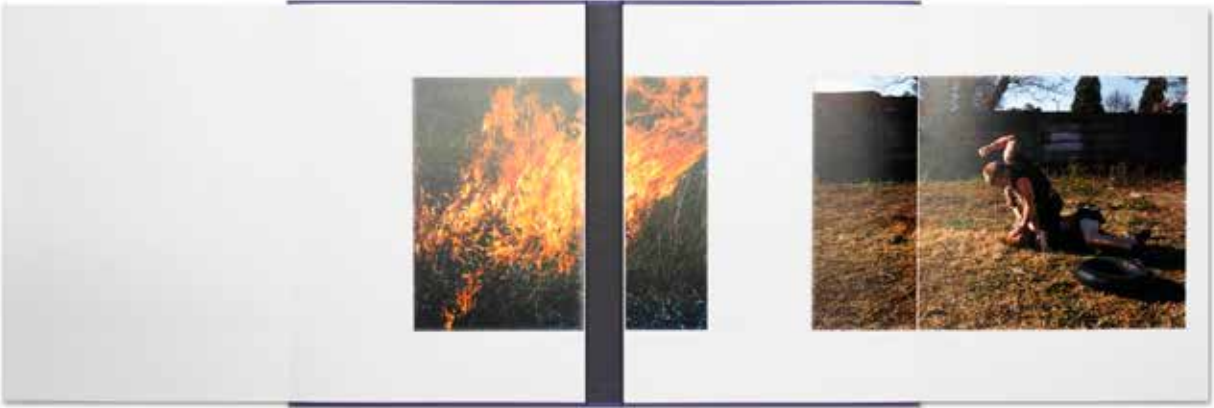
Detail of the book Daleside: Static Dreams