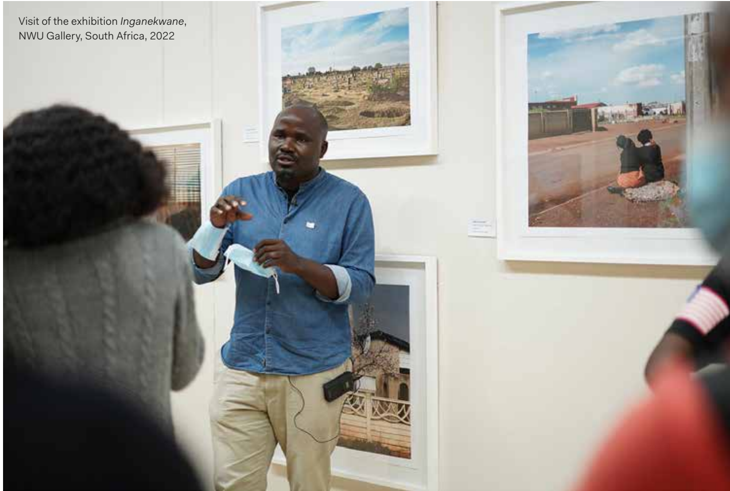
Visit of the exhibition Inganekwane , NWU Gallery, South Africa, 2022