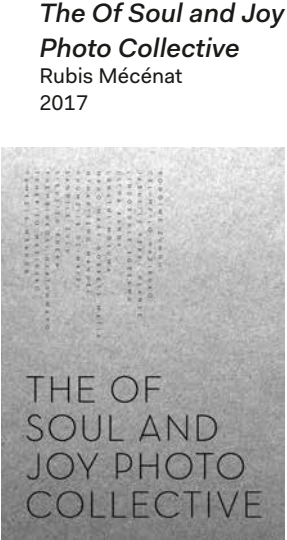
The Of Soul and Joy Photo Collective Rubis Mécénat 2017