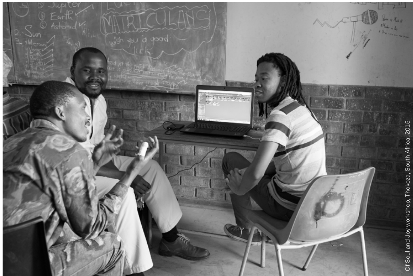
Of Soul and Joy workshop, Thokoza, South Africa, 2015