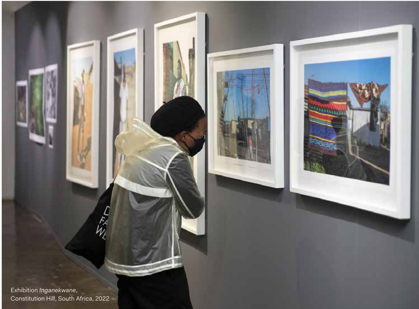
Exhibition Inganekwane , Constitution Hill, South Africa, 2022