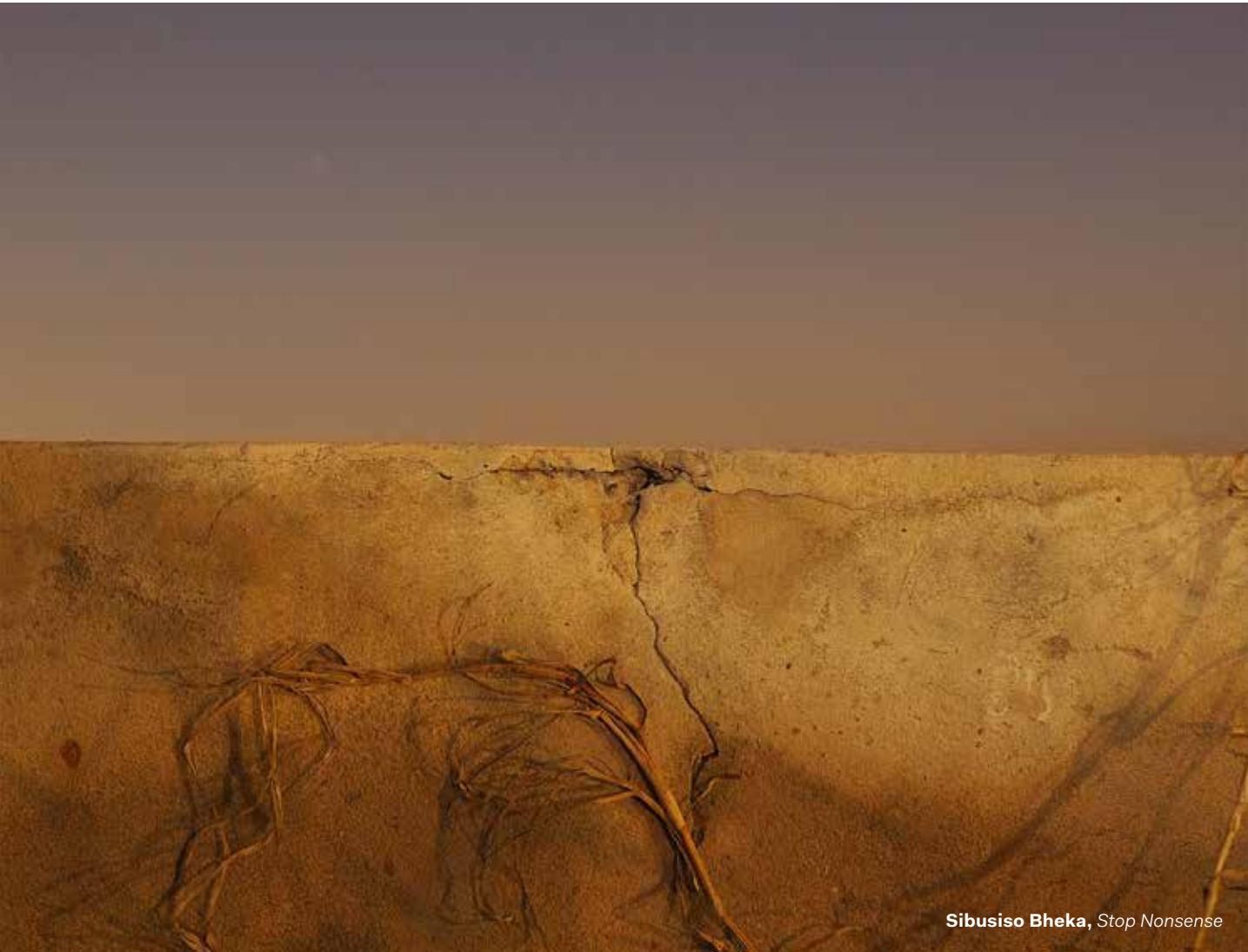
Sibusiso Bheka, Stop Nonsense