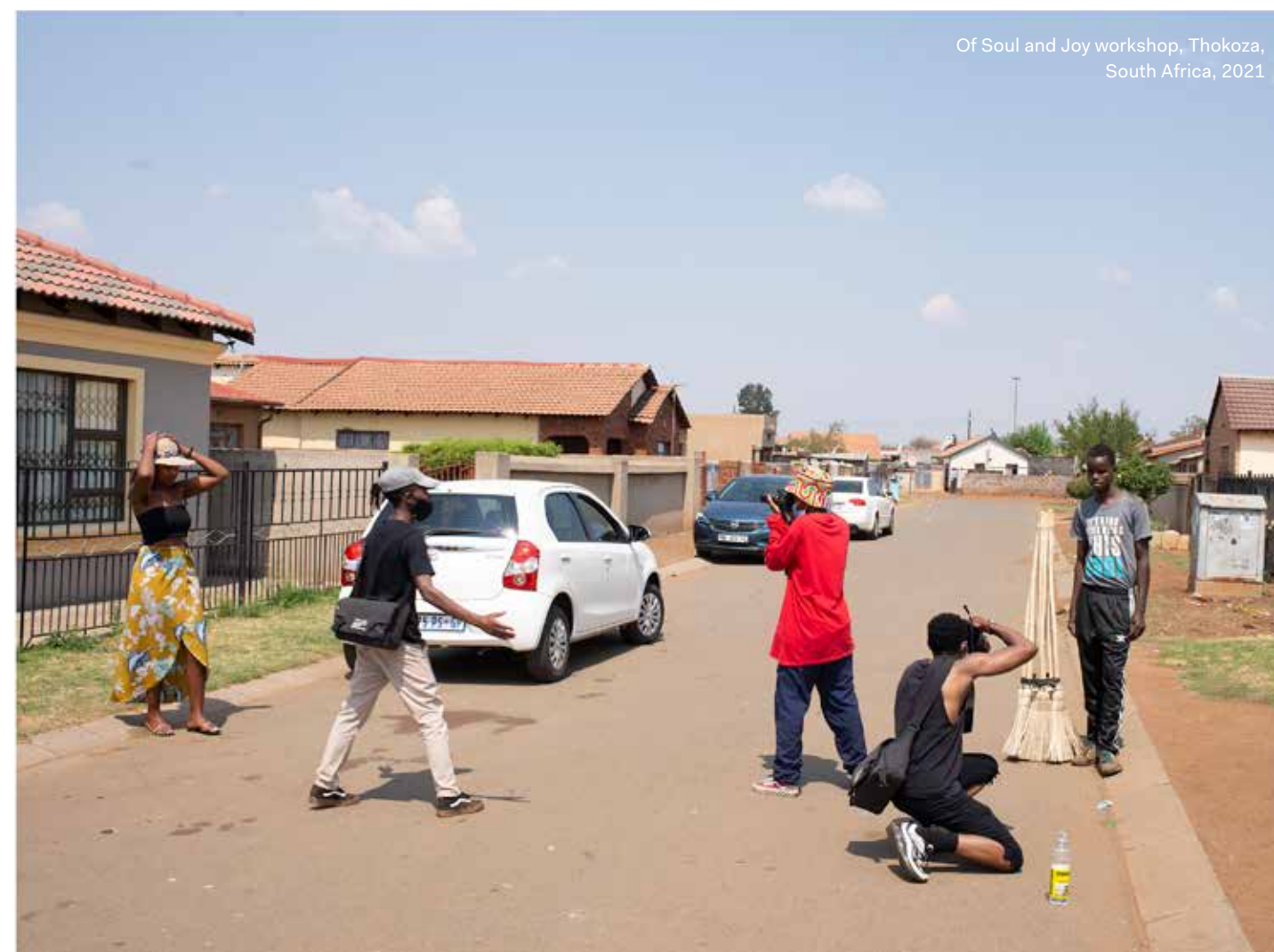
Of Soul and Joy workshop, Thokoza, South Africa, 2021