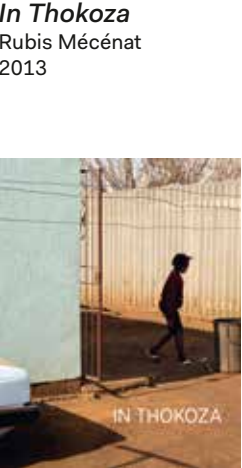
In Thokoza Rubis Mécénat 2013