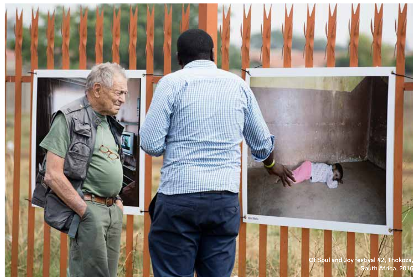
Of Soul and Joy festival #2, Thokoza, South Africa, 2016