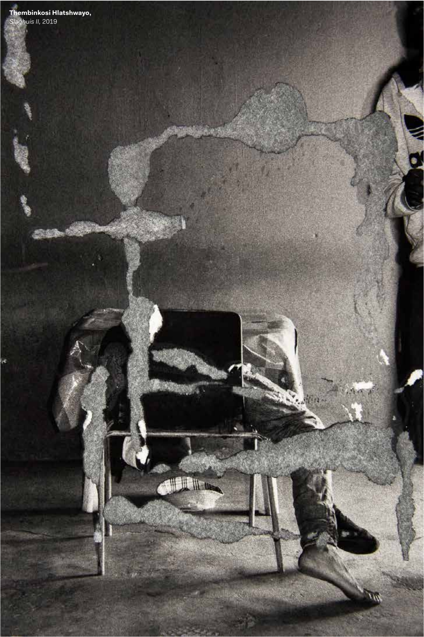
Thembinkosi Hlatshwayo, Slaghuis II , 2019