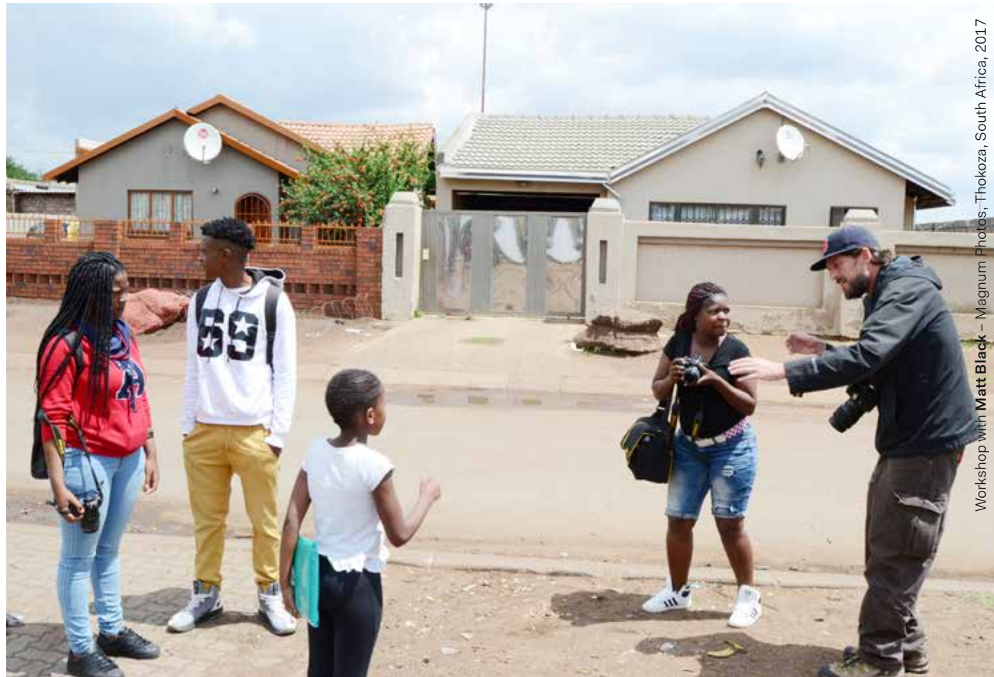
Workshop with Matt Black – Magnum Photos, Thokoza, South Africa, 2017